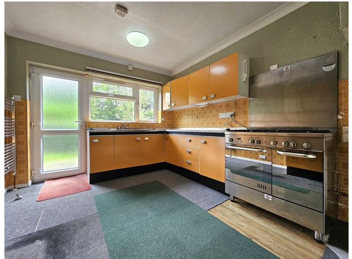
A retro fitted kitchen with a range of wall mounted and base units with worktop over. With space and plumbing for appliances and washers. Free standing double oven with gas hob, wall mounted radiator and ceiling light. Having a glazed door opening onto the garden and a window to the rear elevation.