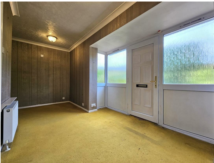
A large reception hall allowing access into all rooms.