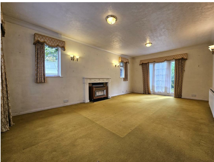
A large living dining room with triple aspect windows to rear front and side elevation. With glazed door opening onto the rear garden, gas fire place, ceiling and wall mounted lighting and wall mounted radiator.