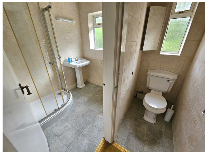
A fitted shower room iwht wash basin and shower cubicle with thermostatic shower. With window to rear elevation, wall mounted radiator and ceiling light.