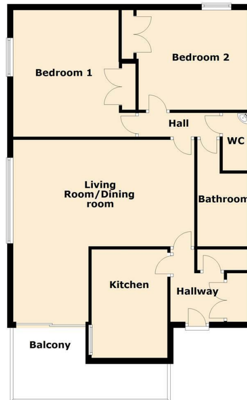
Second Floor Approx. 86.3 sq. metres (929.1 sq. feet)

MONEY LAUNDERING REGULATIONS: Intending purchasers will be asked to produce identification documentation at a later stage and we would ask for your co-operation in order that there will be no delay in agreeing the sale.