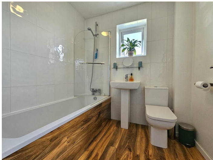
A nicely fitted bathroom with window to rear elevation. with bath, wash basin and toilet and wall mounted heated towel rail.