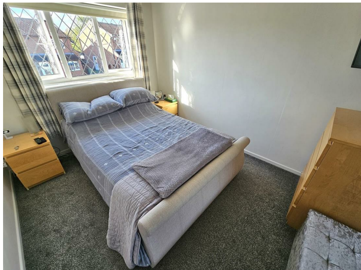
A good sized double room with access into built in storage. With window to front elevation.