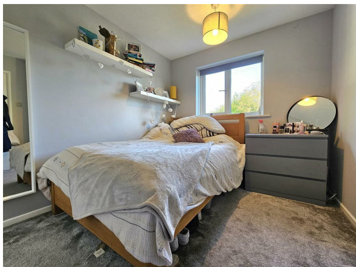
Another double room with storage cupboard and a window to the rear elevation.