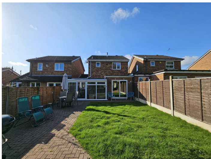
With a large block paved drive to the front allowing parking for numerous vehicles. with charging point and bordered by attractive fencing. To the rear we have a private garden laid mainly to lawn with patio area, garden shed and bordered by panelled fencing.