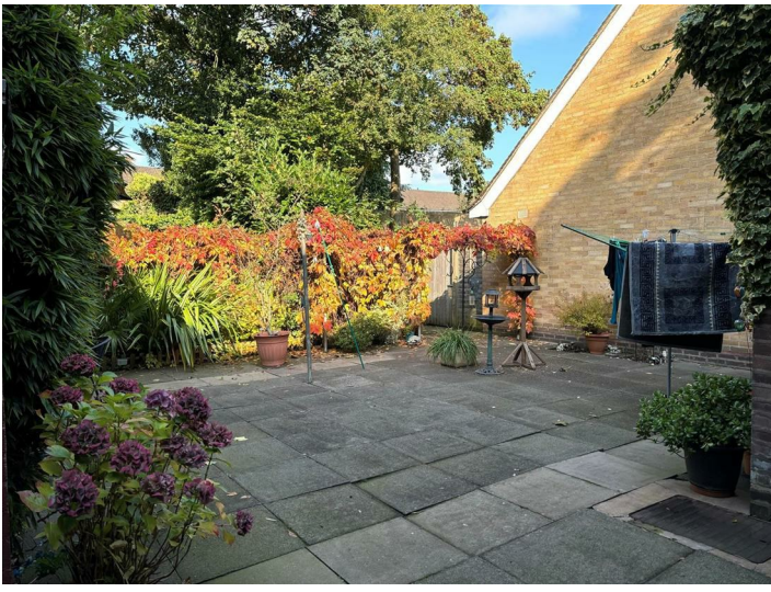
Paved, shared communal garden with allocated storage shed.